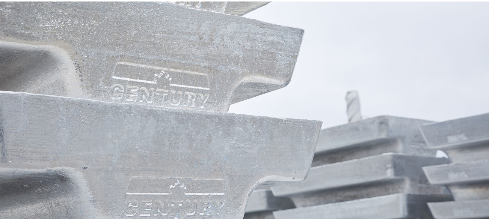
Stacks of aluminum ingots marked with Century Aluminum logo

U.S. industry is a backbone of the nation's economy, producing the goods critical to everyday life, employing millions of Americans in high-quality jobs, and providing an economic anchor for thousands of communities. Yet the sector's energy- and carbon-intensity contributes to nearly one third of the nation's carbon dioxide emissions, representing a unique and complex challenge to achieving a carbon-free economy. Decarbonizing the U.S. industrial sector will require equally unique and innovative technological solutions that leverage multiple pathways, including energy efficiency, electrification, and alternative fuels and feedstocks such as clean hydrogen. The Industrial Demonstrations Program includes new, emerging technologies that aim to help produce clean steel, cement, chemicals, and other materials used in our nation's roads, bridges, transmission lines, electric vehicles, solar panels, wind turbines, and everyday lives, which in turn, benefit every American.