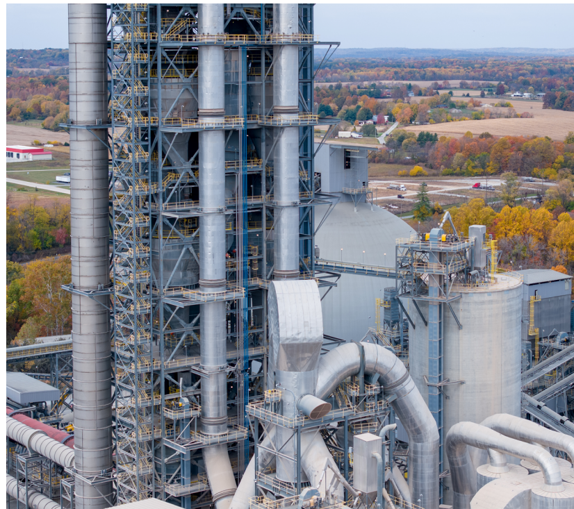
Heidelberg Materials Mitchell Plant – New Cement Preheater-Precalciner Tower.

More details on the Mitchell Cement Plant Decarbonization Project's Community Benefits Commitments can be found in the Community Benefits Commitments Fact Sheet .