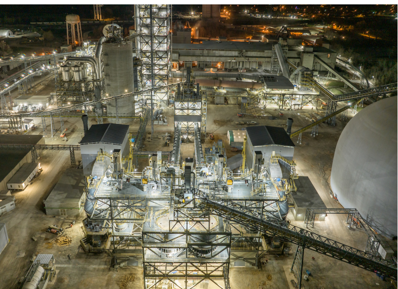
Heidelberg Materials Mitchell Plant – New Cement Finish Milling System

The U.S. industry is a backbone of the nation's economy, producing the goods critical to everyday life, employing millions of Americans in high-quality jobs, and providing an economic anchor for thousands of communities. Yet the sector's energy- and carbon-intensity contributes to nearly one third of the nation's carbon dioxide emissions, representing a unique and complex challenge to achieving a carbon-free economy. Decarbonizing the U.S. industrial sector will require equally unique and innovative technological solutions that leverage multiple pathways, including energy efficiency, electrification, and alternative fuels and feedstocks such as clean hydrogen. The Industrial Demonstrations Program includes new, emerging technologies that aim to help produce clean steel, cement, chemicals and other materials used in our nation's roads, bridges, transmission lines, electric vehicles, solar panels, wind turbines, and everyday lives, which in turn, benefit every American.