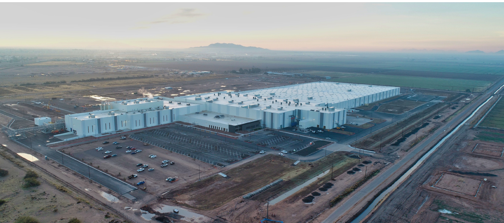
An aerial view of Kohler's Casa Grande, AZ facility

U.S. industry is a backbone of the nation's economy, producing the goods critical to everyday life, employing millions of Americans in high-quality jobs, and providing an economic anchor for thousands of communities. Yet the sector's energy- and carbon-intensity contributes to nearly one third of the nation's carbon dioxide emissions, representing a unique and complex challenge to achieving a carbon-free economy. Decarbonizing the U.S. industrial sector will require equally unique and innovative technological solutions that leverage multiple pathways, including energy efficiency, electrification, and alternative fuels and feedstocks such as clean hydrogen. The Industrial Demonstrations Program includes new, emerging technologies that aim to help produce clean steel, cement, chemicals, and other materials used in our nation's roads, bridges, transmission lines, electric vehicles, solar panels, wind turbines, and everyday lives, which in turn, benefit every American.