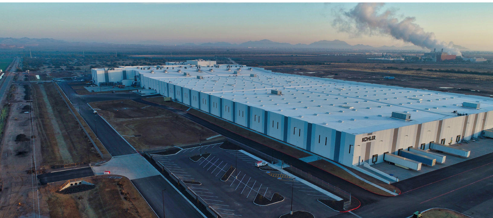
An aerial view of Kohler's Casa Grande, AZ facility

More details on the Vikrell Electric Boiler & Microgrid System project's community benefits commitments can be found in the Community Benefits Commitments Fact Sheet .