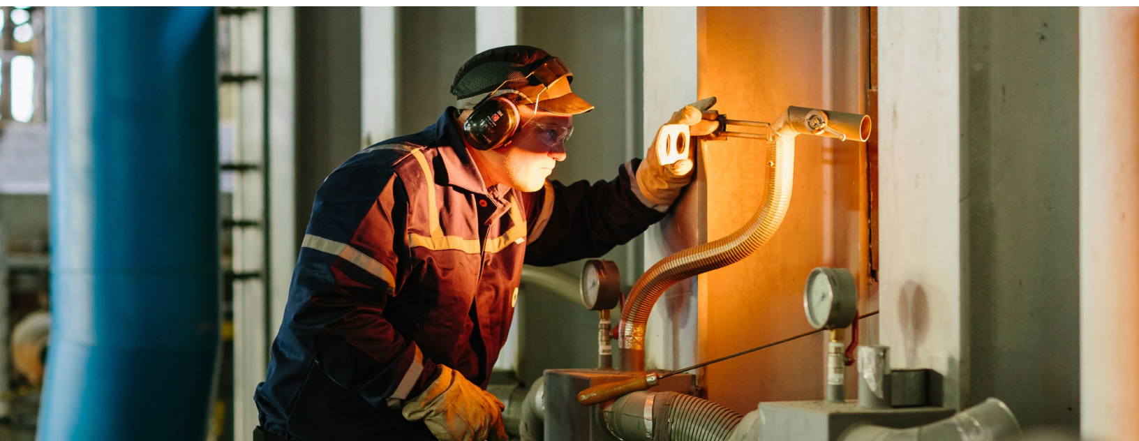
An O-I Glass employee uses a sight glass to inspect the inside of an operating glass furnace

More details on the Glass Furnace Decarbonization Technology Stack Project's community benefits commitments can be found in the Community Benefits Commitments Summary .