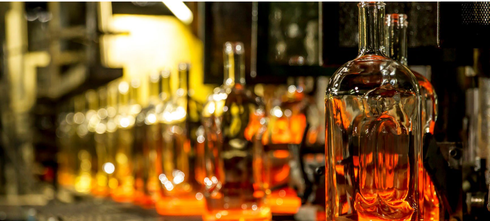
A newly formed glass bottle moves along a conveyor belt at an O-I Glass bottle-making factory

U.S. industry is a backbone of the nation's economy, producing the goods critical to everyday life, employing millions of Americans in high-quality jobs, and providing an economic anchor for thousands of communities. Yet the sector's energy- and carbon-intensity contributes to nearly one third of the nation's carbon dioxide emissions, representing a unique and complex challenge to achieving a carbon-free economy. Decarbonizing the U.S. industrial sector will require equally unique and innovative technological solutions that leverage multiple pathways, including energy efficiency, electrification, and alternative fuels and feedstocks such as clean hydrogen. The Industrial Demonstrations Program includes new, emerging technologies that aim to help produce clean steel, cement, chemicals, and other materials used in our nation's roads, bridges, transmission lines, electric vehicles, solar panels, wind turbines, and everyday lives, which in turn, benefit every American.