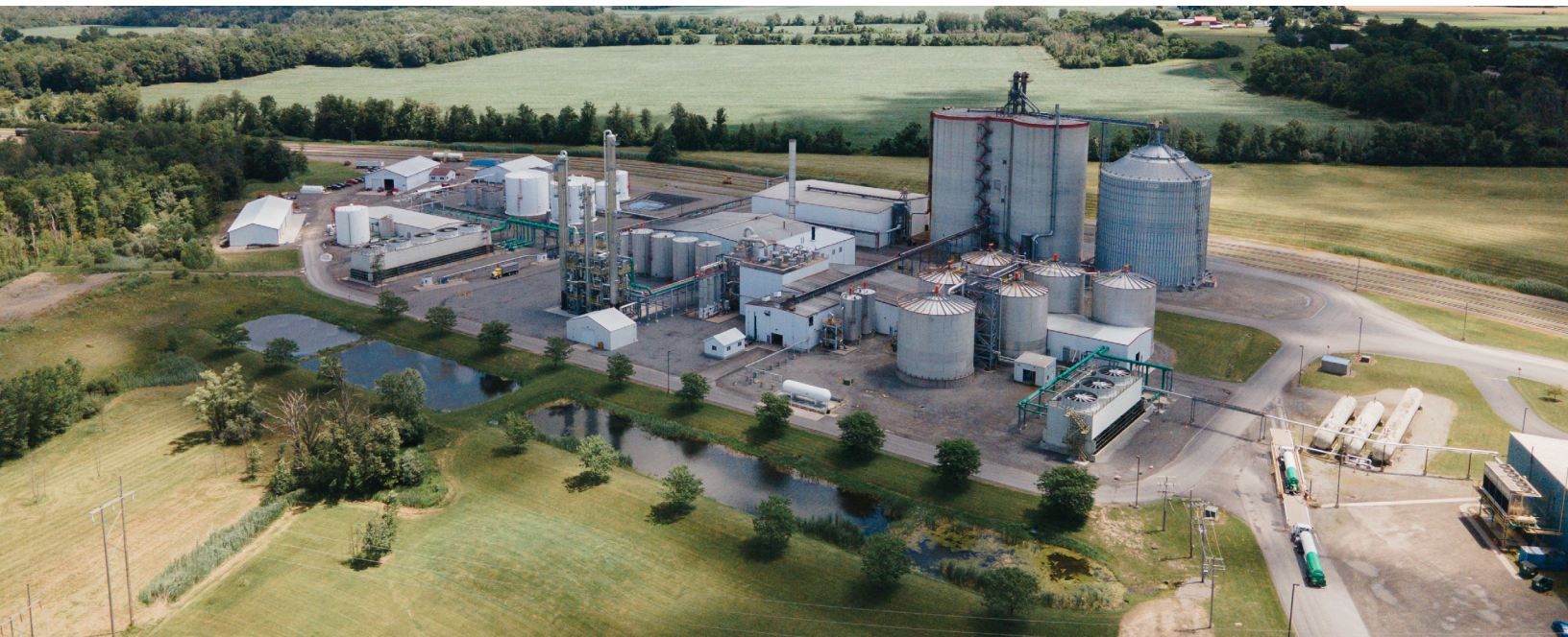
WNYE's Medina, NY facility, the future home of the Skyven Arcturus steam-generating heat pump

More details on the Steam-Generating Heat Pumps for Cross-Sector Deep Decarbonization project's community benefits commitments can be found in the Community Benefits Commitments Summary .