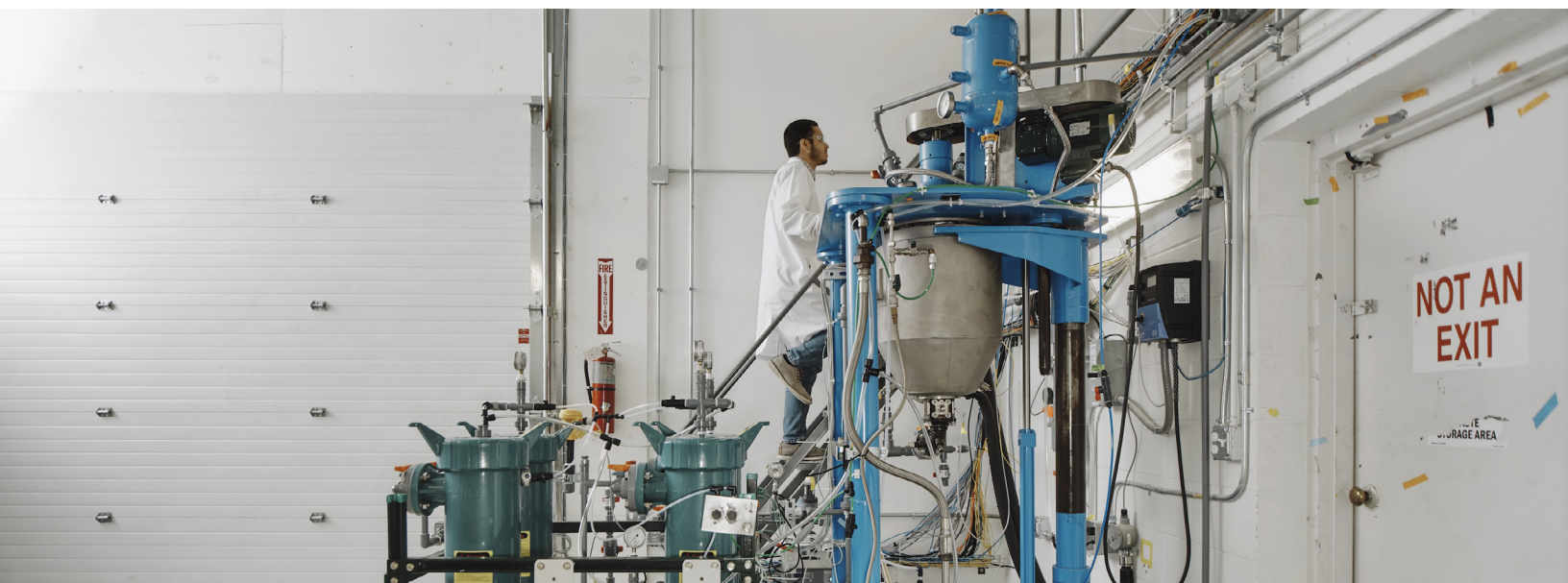
Sublime Systems electrochemically manufactures low-carbon cement that performs like traditional high-emitting cement in concrete

More details on the First Commercial Electrochemical Cement Manufacturing project's community benefits commitments can be found in the Community Benefits Commitments Fact Sheet .