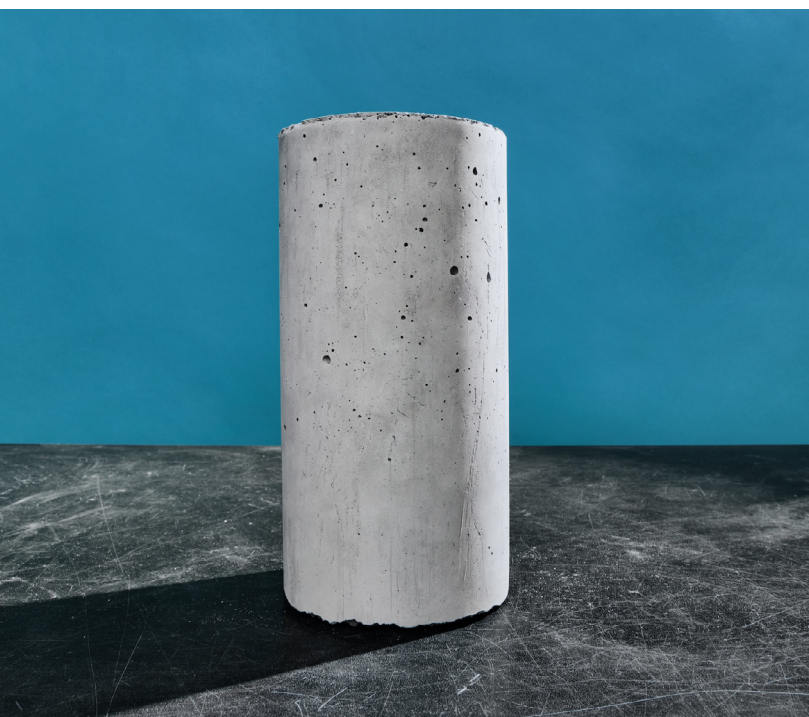
A concrete cylinder made with low-carbon Sublime Cement™

U.S. industry is a backbone of the nation's economy, producing the goods critical to everyday life, employing millions of Americans in high-quality jobs, and providing an economic anchor for thousands of communities. Yet the sector's energy- and carbon-intensity contributes to nearly one third of the nation's carbon dioxide emissions, representing a unique and complex challenge to achieving a carbon-free economy. Decarbonizing the U.S. industrial sector will require equally unique and innovative technological solutions that leverage multiple pathways, including energy efficiency, electrification, and alternative fuels and feedstocks such as clean hydrogen. The Industrial Demonstrations Program includes new, emerging technologies that aim to help produce clean steel, cement, chemicals, and other materials used in our nation's roads, bridges, transmission lines, electric vehicles, solar panels, wind turbines, and everyday lives, which in turn, benefit every American.