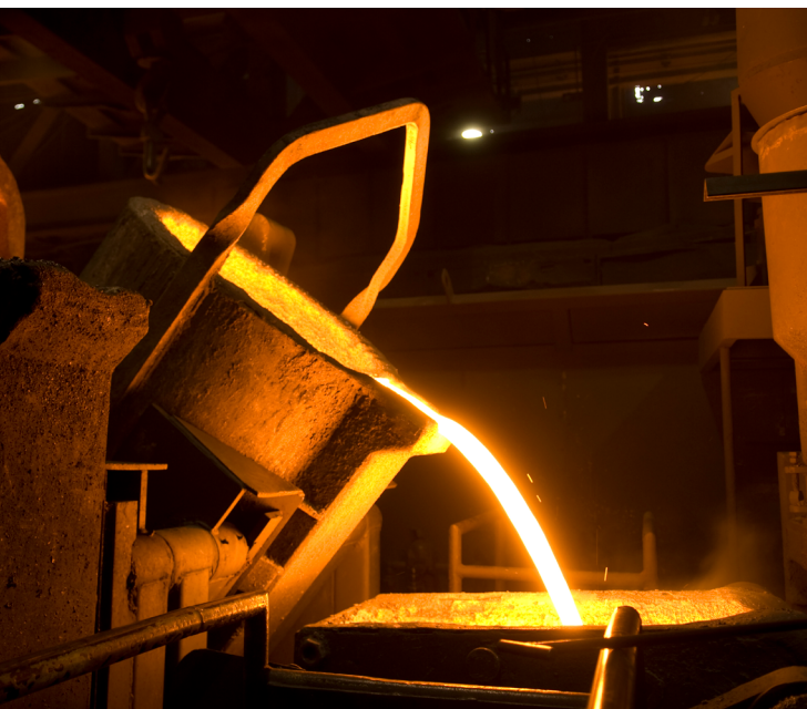
Molten iron flowing

More details on the Iron Electric Induction Conversion project's community benefits commitments can be found in the Community Benefits Commitments Fact Sheet .