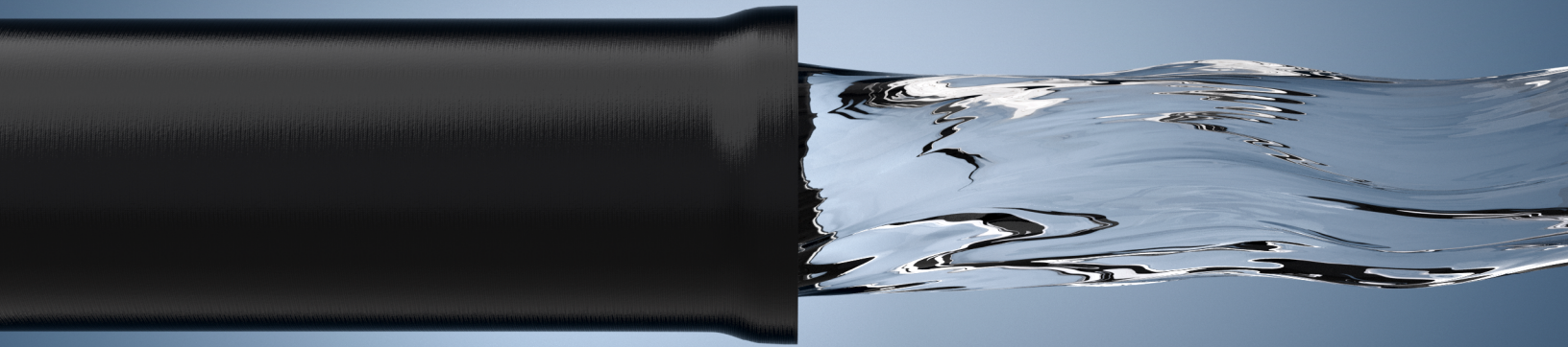
Clean water flowing from ductile iron pipe

U.S. industry is a backbone of the nation's economy, producing the goods critical to everyday life, employing millions of Americans in high-quality jobs, and providing an economic anchor for thousands of communities. Yet the sector's energy- and carbon-intensity contributes to nearly one third of the nation's carbon dioxide emissions, representing a unique and complex challenge to achieving a carbon-free economy. Decarbonizing the U.S. industrial sector will require equally unique and innovative technological solutions that leverage multiple pathways, including energy efficiency, electrification, and alternative fuels and feedstocks such as clean hydrogen. The Industrial Demonstrations Program includes new, emerging technologies that aim to help produce clean steel, cement, chemicals, and other materials used in our nation's roads, bridges, transmission lines, electric vehicles, solar panels, wind turbines, and everyday lives, which in turn, benefit every American.